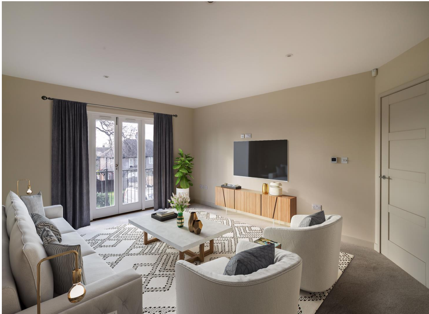
Sitting Room 15' 9" x 13' 0" (4.80m x 3.96m) Rear aspect, doors opening onto Juliette balcony.